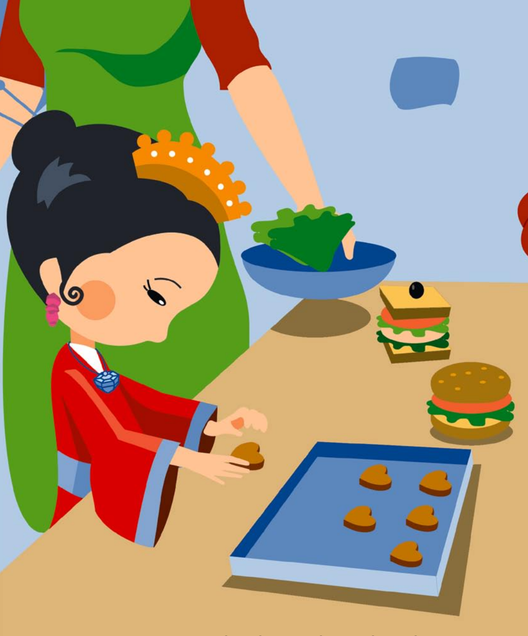
Princess Rose makes heart-shaped cookies.